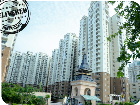
THE HYDE PARK Sector 78, Noida