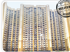
EXPRESS PARK VIEW-II (2nd Phase) CHI-V, Greater Noida