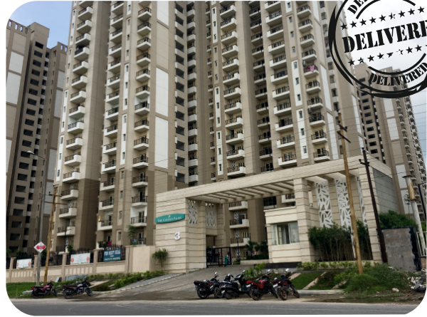
THE GOLDEN PALMS Sector 168, Noida