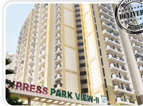
EXPRESS PARK VIEW-II (1st Phase) CHI-V, Greater Noida