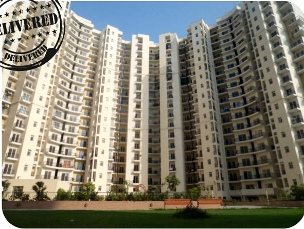
EXPRESS PARK VIEW-I Greater Noida