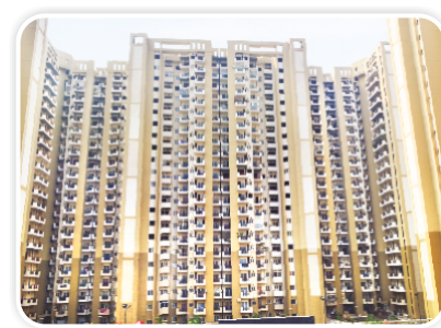
EXPRESS PARK VIEW-II (2nd Phase) CHI-V, Greater Noida