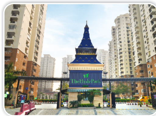
THE HYDE PARK Sector 78 Noida