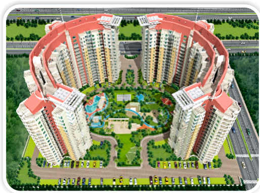
EXPRESS PARK VIEW-I Greater Noida