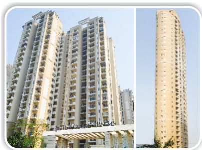
THE GOLDEN PALMS Sector 168, Noida